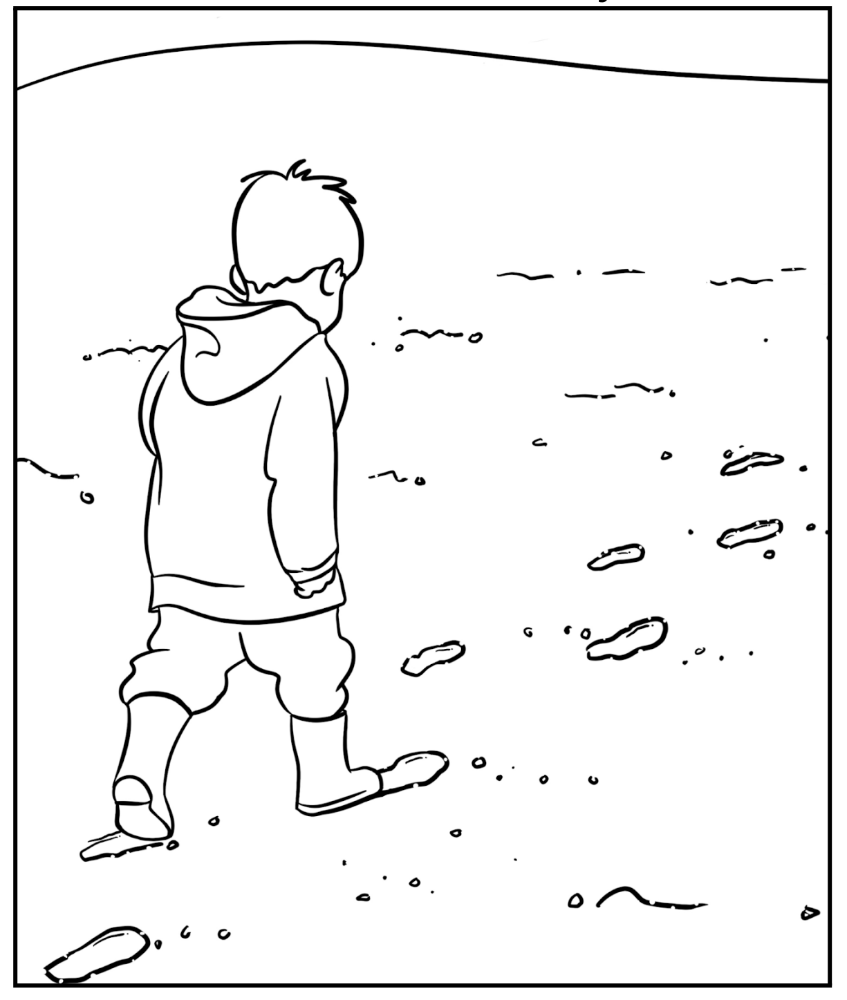
"Walk As He Walked" 1 John 1:1—2:6