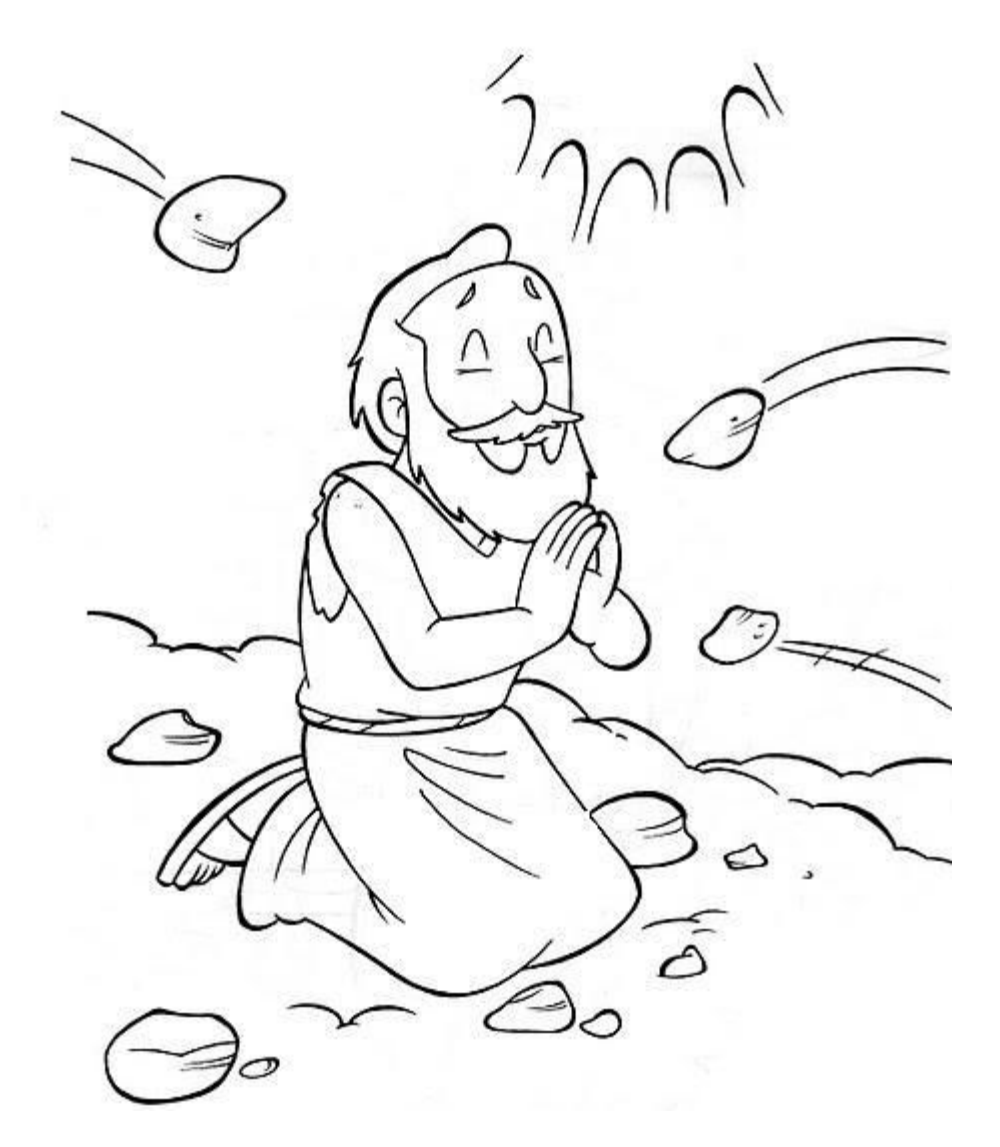
"We Must Suffer to Enter The Creator's Kingdom" Acts 14:1-28