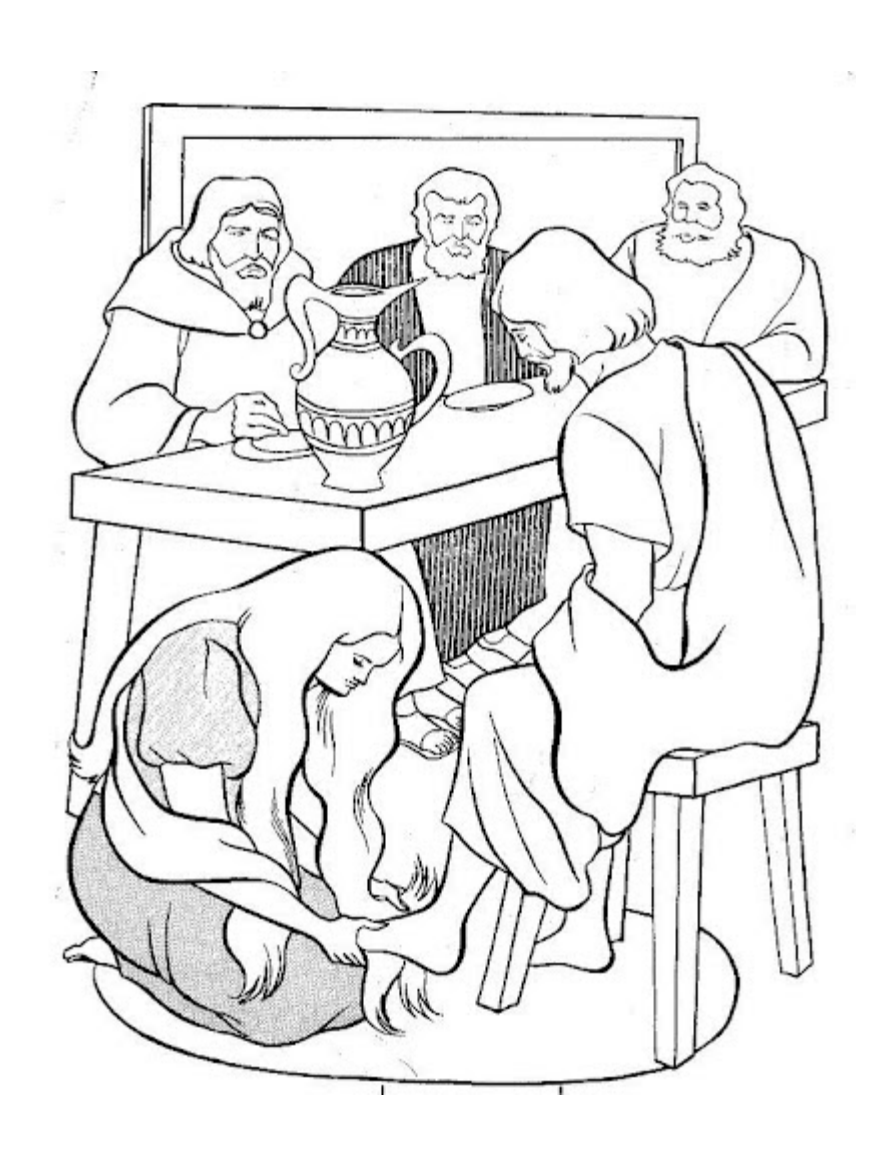
"Forgive & Be Forgiven" Luke 6:12—7:35