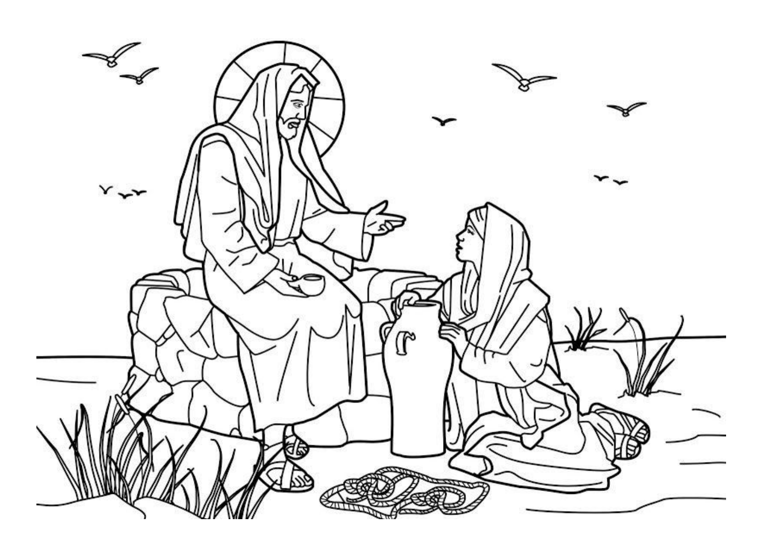
"In Spirit & Truth" John 4